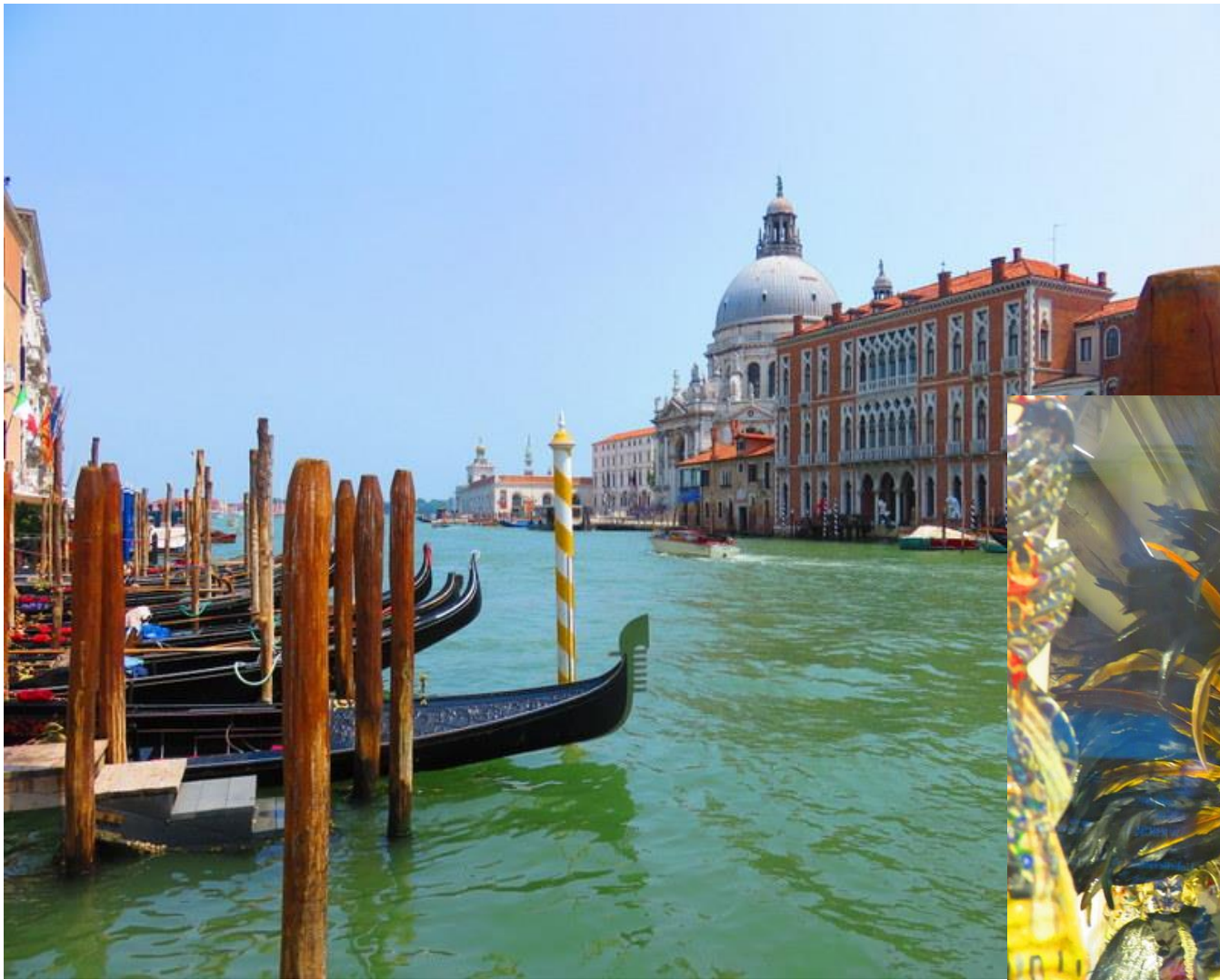
Grand Canal, Venezia